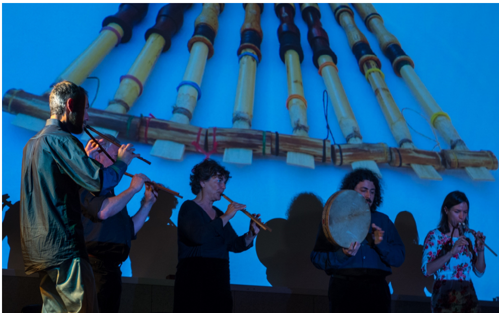
4th Meeting of the Workshop of Dionysus – concert in Tarquinia, May 2017