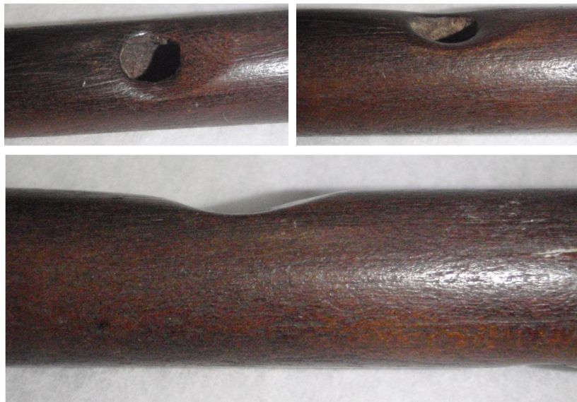
Louvre aulos, low pipe thumb hole (bulb to left)